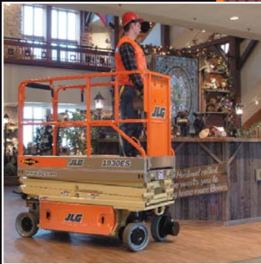
Quieter, Cleaner Operation for Indoor Work Areas