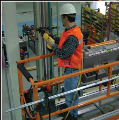
Application-Specific Tools to Do Your Best Work