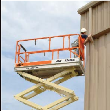
Longer Duty Cycles Keep You On the Job Longer